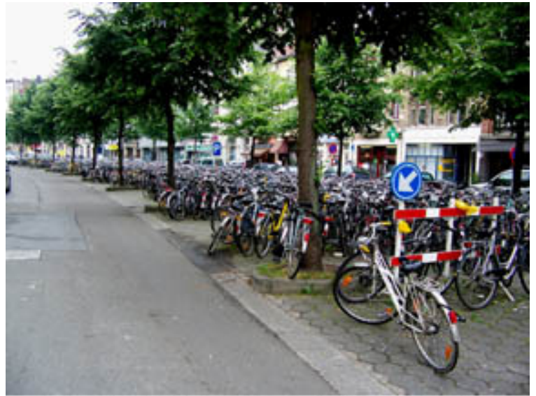
A world of bikes: why can't the U.S. do this?

See, this is expected blog problem: without meaning to, I've got us in a bind here. Just finished this thing about Gent that I started DAYS ago, and I'm already leaving Oslo for Amsterdam after 3 days here and one in Köln. When do I tell that story? Now? Or do I now go back to the beginning, April 21 st , departing Berkeley with a wild mix of books, supplies, and furnishings for my East Coast son and daughter piled into the back of the Toyota pickup, headed for what amounted to 6000 miles of adventure across that still-great land of ours, seeking out the best friends I never get to see, doing up the New Orleans Jazz & Heritage Festival and hangin with my amazing cousin in the Ozarks and . . . ? You get the picture. Well, just doing my best, at least I've dribbled out these few beads of consciousness, hopefully worth sharing, and I hope someday soon this will find itself in its proper place in a blog. My first attempt, installment, whatever, we'll just have to see. Let me find a place for this on the net, then I'll put each piece in a pdf file, like this, and send it to yas, at the same time posting it in typically confusing blog-order out in cyberspace. Okay, thassall for now, write if you get work, hang by your thumbs, you know the drill. Miss you all!