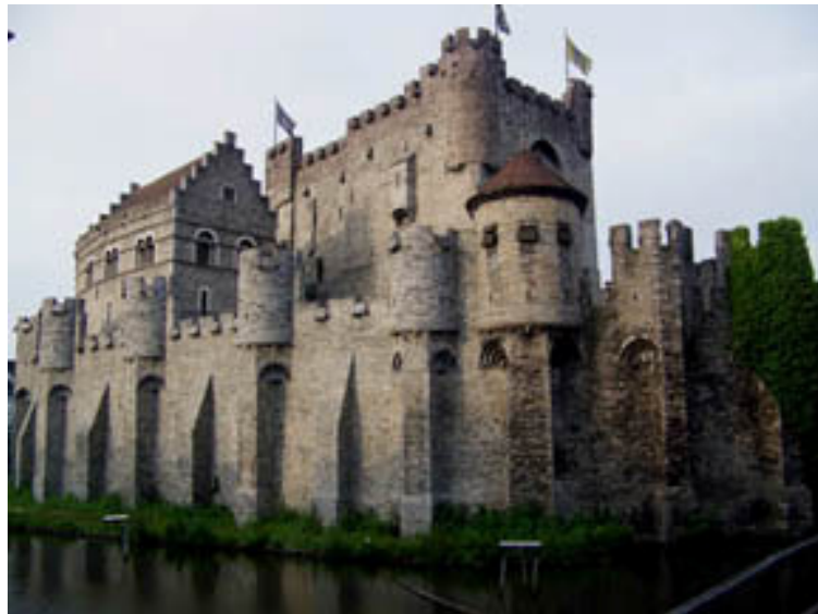
Gent - Castle of the Counts

By the time I get to the end of this first posting I'll have gone from here all the way back to the beginning of the story, and then all the way back, through this part again, then on to the end of the trip. So, begin!