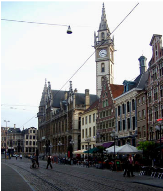
The plaza around the corner