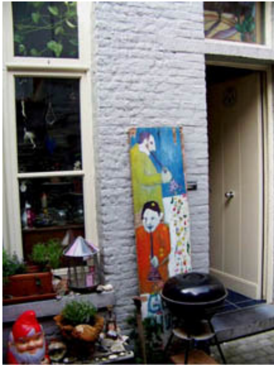
Anybody would know whose house . . .